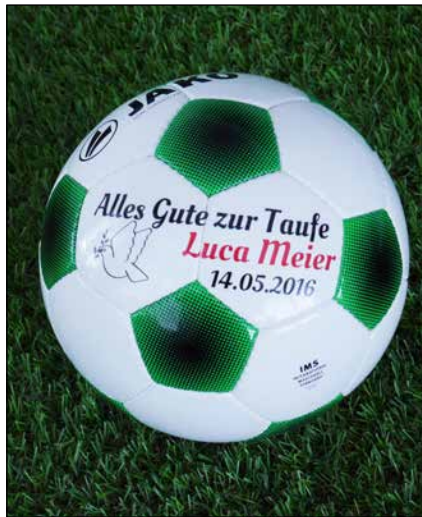
Personalized in two and half minutes, ready for shipment. The Balleristo product range has recently expanded from plasma-treated footballs, golf balls and volleyballs to include virtually all types of sports ball.

The footballs printed in this system are almost exclusively branded ones, such as those supplied by Jako AG from Baden-Württemberg. They are supplied with a screen-printed imprint which the ball manufacturer