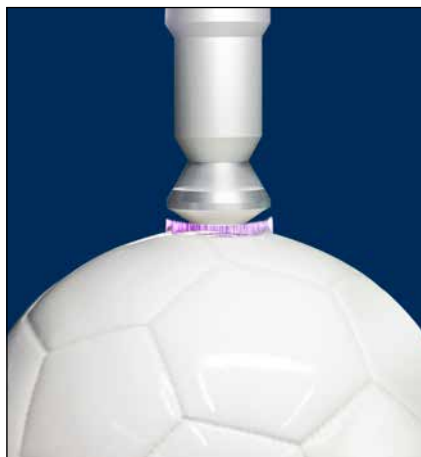
Openair-Plasma rotary nozzles work at speeds of 2700rpm. The plasma emitted at the side of the violet arc of light (not visible) strongly activates the surface of the ball, resulting in homogenous wettability.

The atmospheric plasma jet process developed in 1995 by the Westphalian systems engineer and now used in virtually every branch of industry around the world is a dry process which combines the dual effects of microfine cleaning and simultaneous